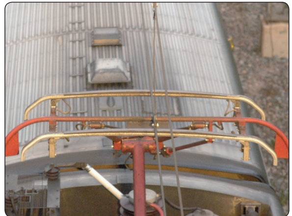
Photo of an undamaged pantograph on a train passing at 209 km/h.