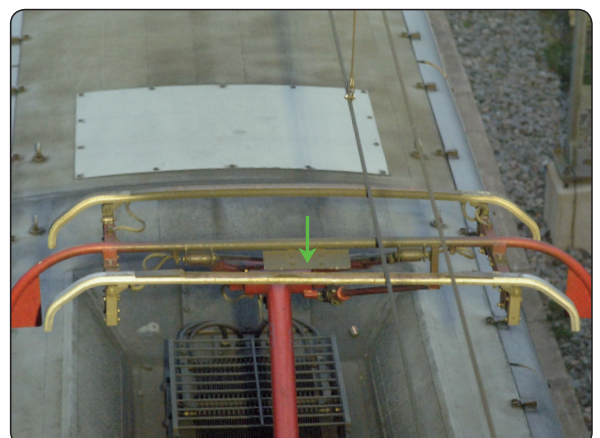
Photo of a damaged pantograph. The image is transferred to the Master Controller (MC) and further to the Image Processing Unit which separates and checks the image of the carbon strips.